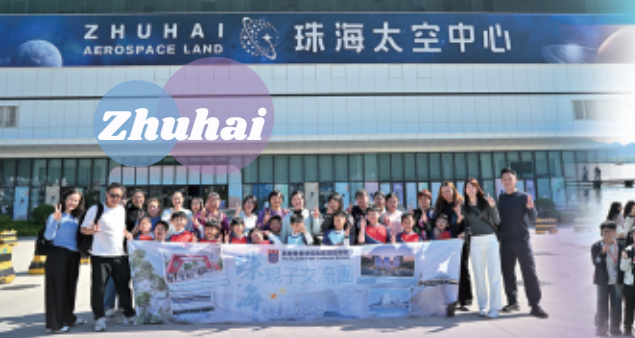
ZHUHAI AEROSPACE LAND 珠海太空中心